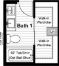
Alternate Wardrobe w/ Opt Full Bath 2