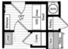
Option Laundry Room (Replaces Walk-In Pantry)