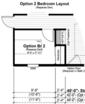
Option 2 Bedroom Layout (Replaces Den)