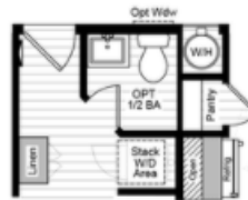
Option 1/2 Bath (Replaces Walk-In Pantry)