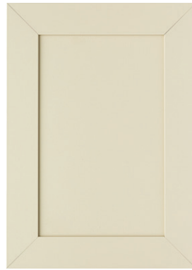
Studio Beige Picture Frame Duracraft Cabinets Primary Kitchen and Bathroom Cabinets