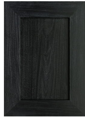
Onyx Picture Frame Duracraft Cabinets Kitchen Island Cabinets