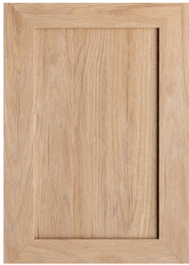
Bishop Oak Picture Frame Duracraft Cabinets Primary Kitchen and Bathroom Cabinets